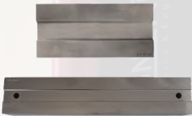
MPI LIFTING BLOCKS