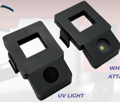
WHITE LIGHT ATTACHMENT