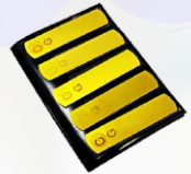
BURMAH CASTROL STRIP